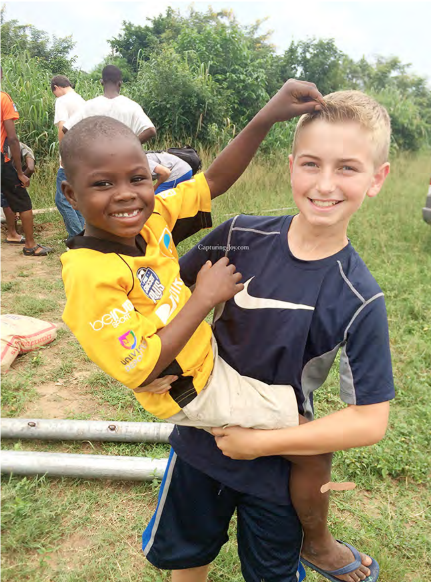
The children were playing a Ghanaian game that involves clapping and foot motions