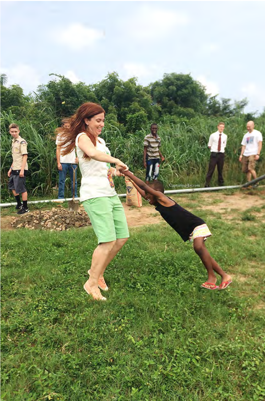
The hair of ours was quite fascinating to them...