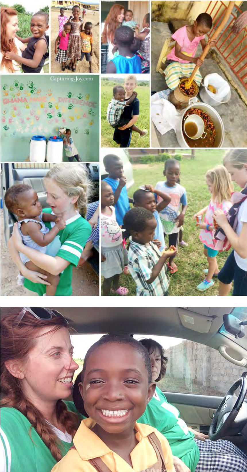
Nearby the home is the school that not only teaches the kids from Ghana Make a Difference home , but also from the nearby community. No electricity, wooden desks for school.