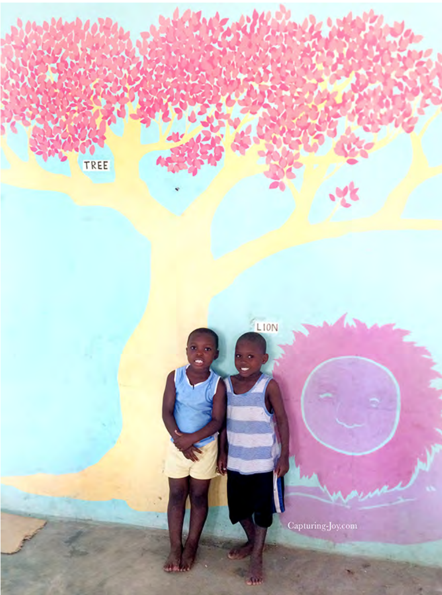
After some introductions, it didn't take long for all the kids to warm up to each other.